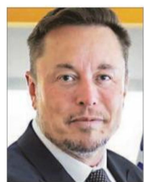
'Need to reach positive cash flow before we have the luxury of anything else,' Elon Musk said in a tweet

"Need to reach positive cash flow before we have the luxury of anything else," Elon Musk said in a tweet early on Saturday. After Musk acquired Twitter in October, the social media firm faced months of chaos, including layoffs of thousands of employees, criticism over lax content moderation, and an exodus of many advertisers who did not want their ads appearing next to inappropriate content.