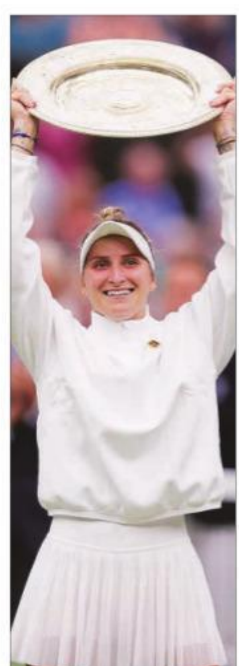
Czech Republic's Marketa Vondrousova celebrates with the trophy

UNSEEDED MARKETKA VONDROUSOVA of the Czech Republic stunned Tunisia's Ons Jabeur 6-4 6-4 to win the Wimbledon women's singles final on Saturday. The 24-year-old left-hander became the first unseeded player to win the Wimbledon women's singles title in the professional era, leaving sixth seed Jabeur as the runner-up for the second successive year.