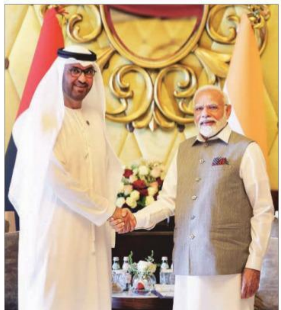
Prime Minister Narendra Modi with the UN climate conference's president-designate Sultan Al Jaber in Abu Dhabi

PRIME MINISTER NARENDRA Modi Prime Minister Narendra Modi and UAE President Sheikh Mohamed bin Zayed Al Nahyan on Saturday said there was an urgent need for developed countries to fulfill the $100 billion delivery plan to mitigate and adapt to the effects of climate change.